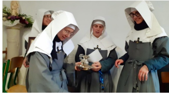
Above: The Daughters of Wisdom received some gifts to celebrate their twentieth anniversary.

Our doctrinal battle also continues, both traditionally, through specific instruction, and in a more modern way, via the internet. This latter method allows us to exert a growing influence on the French traditionalist movement.