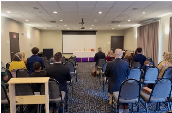
Left: Parishioners praying the Rosary before Sunday Mass in Louisiana.