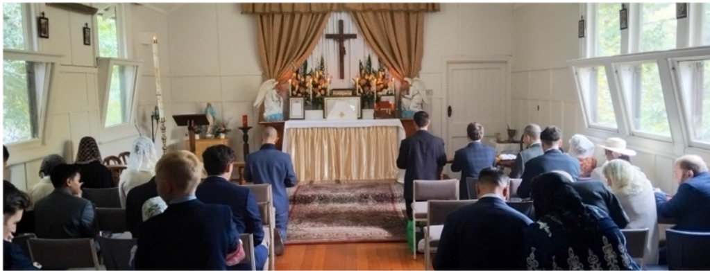
Below: altar prepared for principal Sunday Mass.

With the help of a very generous benefactor and the support of the faithful, we were able to purchase a "real" church building just after Christmas. The purchase of our first church building is a major milestone for the Apostolate, giving us security with many opportunities for growth and expansion. Lent saw a Day of Recollection for men, and another for women, as well as the Holy Week ceremonies and our first Sung Masses in the new chapel.