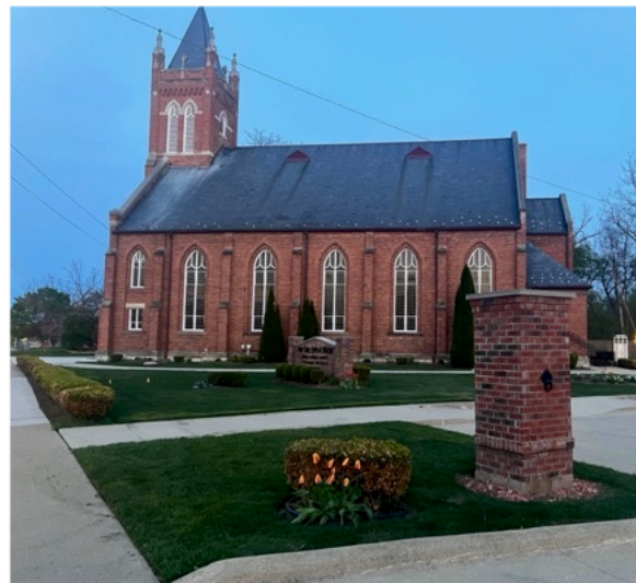
Above: outside view of the church.

We are blessed with the celebrations of the Church's holy liturgy throughout the year, thanks to the dedication of our servers,