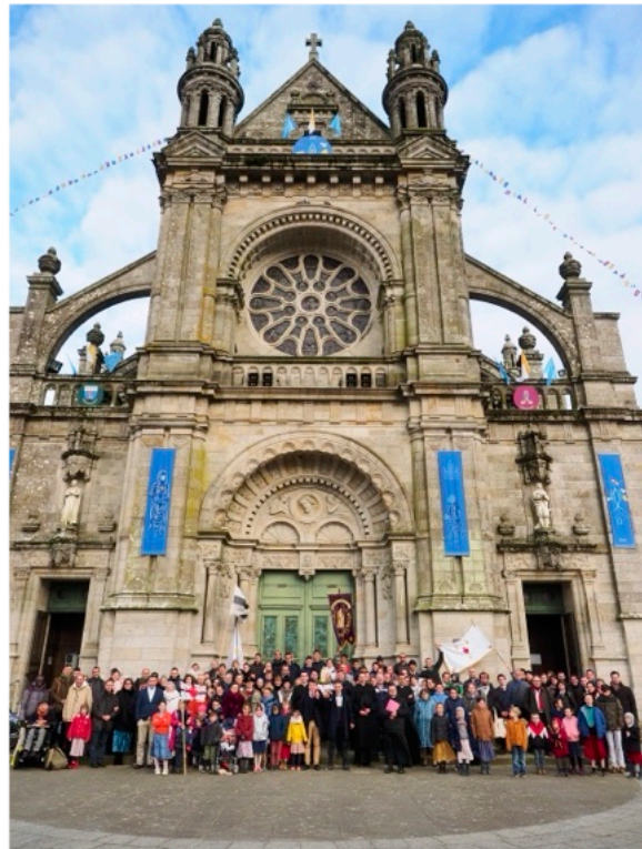
Above: pilgrimage to the shrine of Sainte Anne d'Auray

On April 12th, we organized a outdoor way of the cross, in Pontchateau, following the imposant life-sized stations, up to the calvary originally built by saint Louis-Marie de Montfort. The Sacred Triduum was solemnly celebrated in our main chapel of Christ the King, in Nantes, thanks to the help of a couple of seminarians coming across the Atlantic Ocean from Most Holy Trinity Seminary. On Holy Saturday, four adults were baptized, as well as two babies on Easter Sunday.